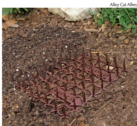
Alley Cat Allies

Set chicken wire firmly into the dirt with sharp edges rolled under. Consider Cat Scat™ (below) plastic mats that you cut into smaller